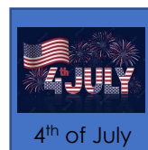
4th of July